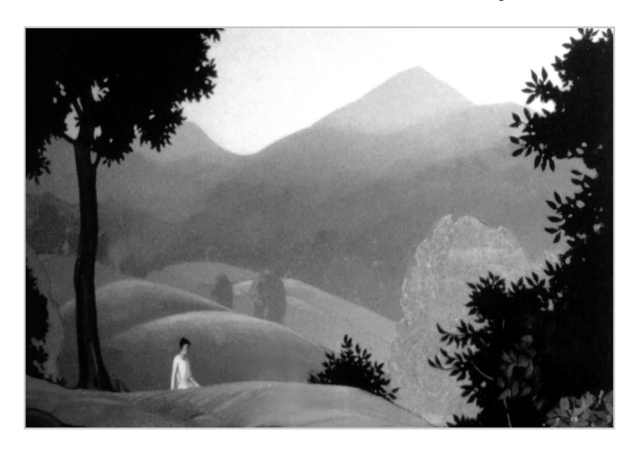
Woman in Mountainscape, oil painting by Clifton Wheeler 40" x 60"

The extant art was the last of the Portfolio items to be moved out of the basement. As the final pieces went out the door and the old club room was about to be locked, the group paused to look over the space one last time. For some reason, their attention was drawn toward the fireplace and the