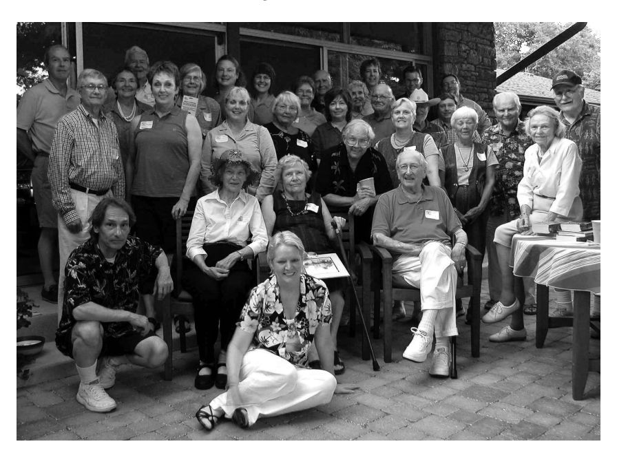
Portfolio Club Picnic July 15, 2006

The annual summer picnic is a long-standing Portfolio tradition. Held at Portfolians' homes or at public, historic sites and facilities over the last 25 years, the picnic is an informal gathering harkening back to the club's Bohemian roots. Funds collected from the picnic's auction of member-provided art, books and other desirable items support the Portfolio Annual Scholarship and help cover expenses for the coming club year.